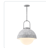
PD507216SL0P Steel Shade/Opal Matte Glass

*For complete warranty terms, please visit: www.aloralighting.com/warranty