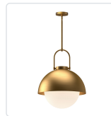
PD507216AGOP Aged Gold/Opal Matte Glass