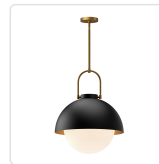
PD507216MBOP Matte Black/Opal Matte Glass